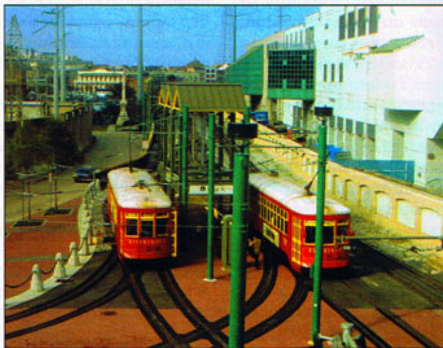
At New Orleans, two RTA-built Perley Thomas replica streetcars pass each other at the foot of Canal Street, on the Riverfront Line.

■ Little Rock: Central Arkansas Transit Authority (CATA) is developing the 2.1-mile River Rail streetcar project, which will link downtown Little Rock with North Little Rock along the Arkansas River. Three replica double truck Birney cars are on order with Gomaco.